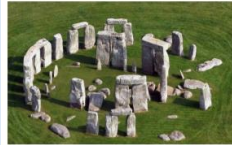
Stone Henge - a prehistoric monument in Wiltshire, England. It consists of a ring of standing stones, with each standing stone around 4 metres high. Its purpose and how it was built remains uncertain.