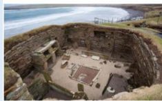
Skara Brae - a stone-built Neolithic settlement, located in the Orkney region in Scotland. It is a cluster of eight houses, which was occupied between 3000 and 2500 BC.