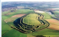
Maiden Castle - one of the largest and most complex Iron Age hillforts in Europe. It is located in Dorset, England. It was built around 100 BC and once protected hundreds of residents.