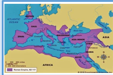
Roman Empire AD 117

Caesar (100—44BC) In 55BC Caesar, with 80 ships and 80,000 men, tried to invade England but he didn't succeed. The next year he came back with 800 and again he didn't succeed to conquer South-England.